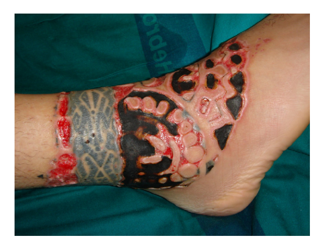
Fig. 1 – Patient who tried to remove a tattoo with a chemical product.

There are also some important biochemical differences between them. The structure of biological proteins involves not only a specific amino acid sequence, but also a threedimensional structure dependent on weak forces, such as