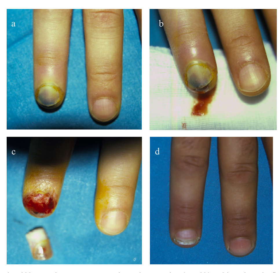
Fig. 4 – Hydrofluoric acid burns. These are very corrosive and penetrating. (a and b) In this patient, the finger affected was treated with subcutaneous infiltration of calcium gluconate beneath the nail. (c and d) The nail was removed after infiltration, and the outcome 2 months later.