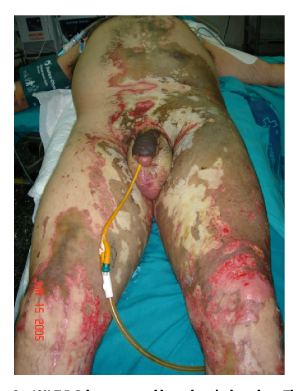
Fig. 2 – 40% T.B.S. burns caused by a chemical product. The ABC of Trauma and Secondary Assessment and all general principles of Trauma and Burn Care apply to chemical burns.

hydrogen bonding or van der Waal's forces. These threedimensional structures are key elements for the biological activity on the proteins, and are easily disrupted by external factors. Application of heat or chemicals, especially pH disturbances, can cause the structures to fall apart. In thermal injuries, there is a rapid coagulation of protein due to irreversible cross-linking reactions, whereas in chemical burns the protein destruction is continued by other mechanisms, mainly hydrolysis. These mechanisms may continue so long as traces of the offending agent are present, especially in